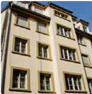
März hall of residence, category E