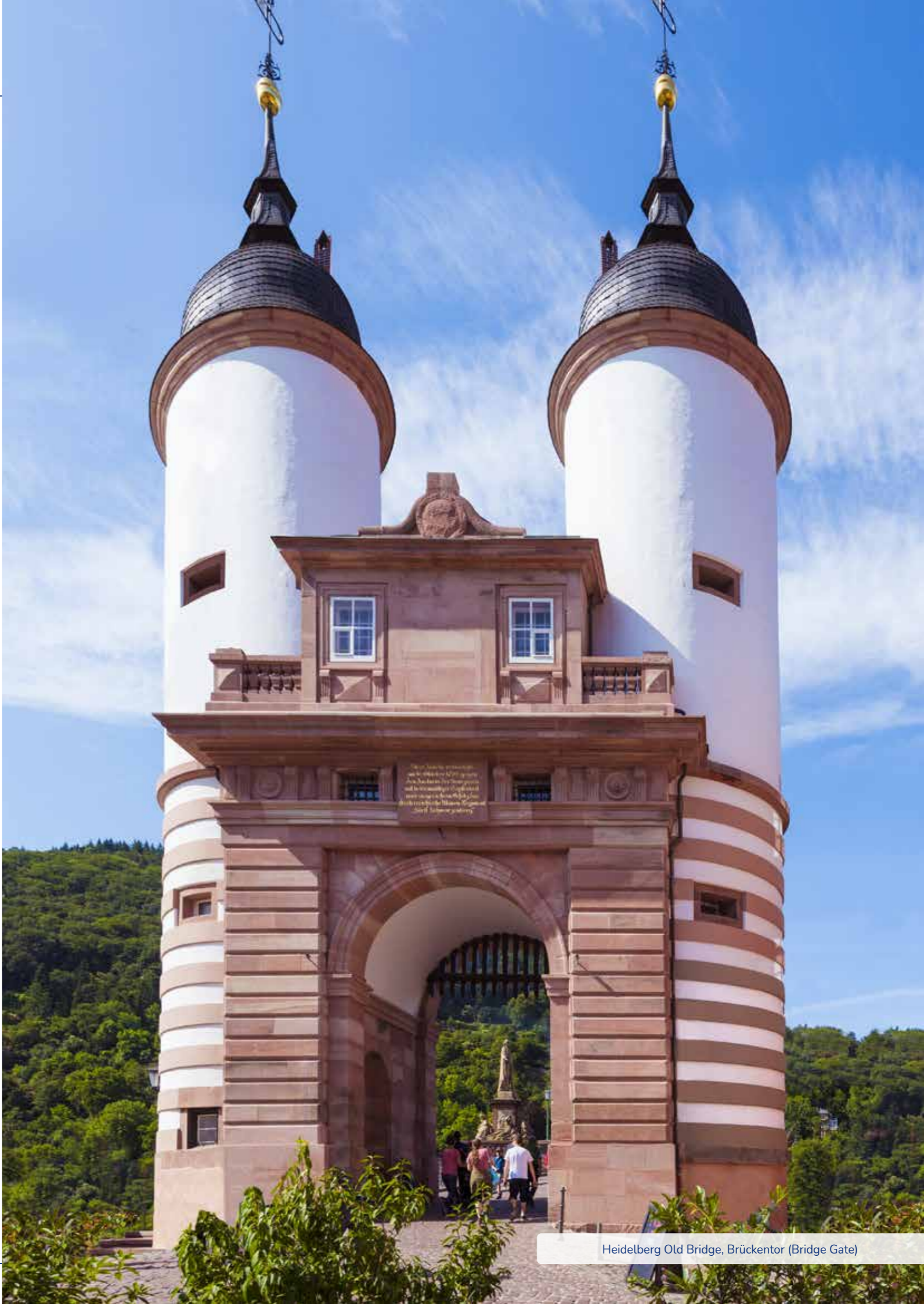
Heidelberg Old Bridge, Brückentor (Bridge Gate)