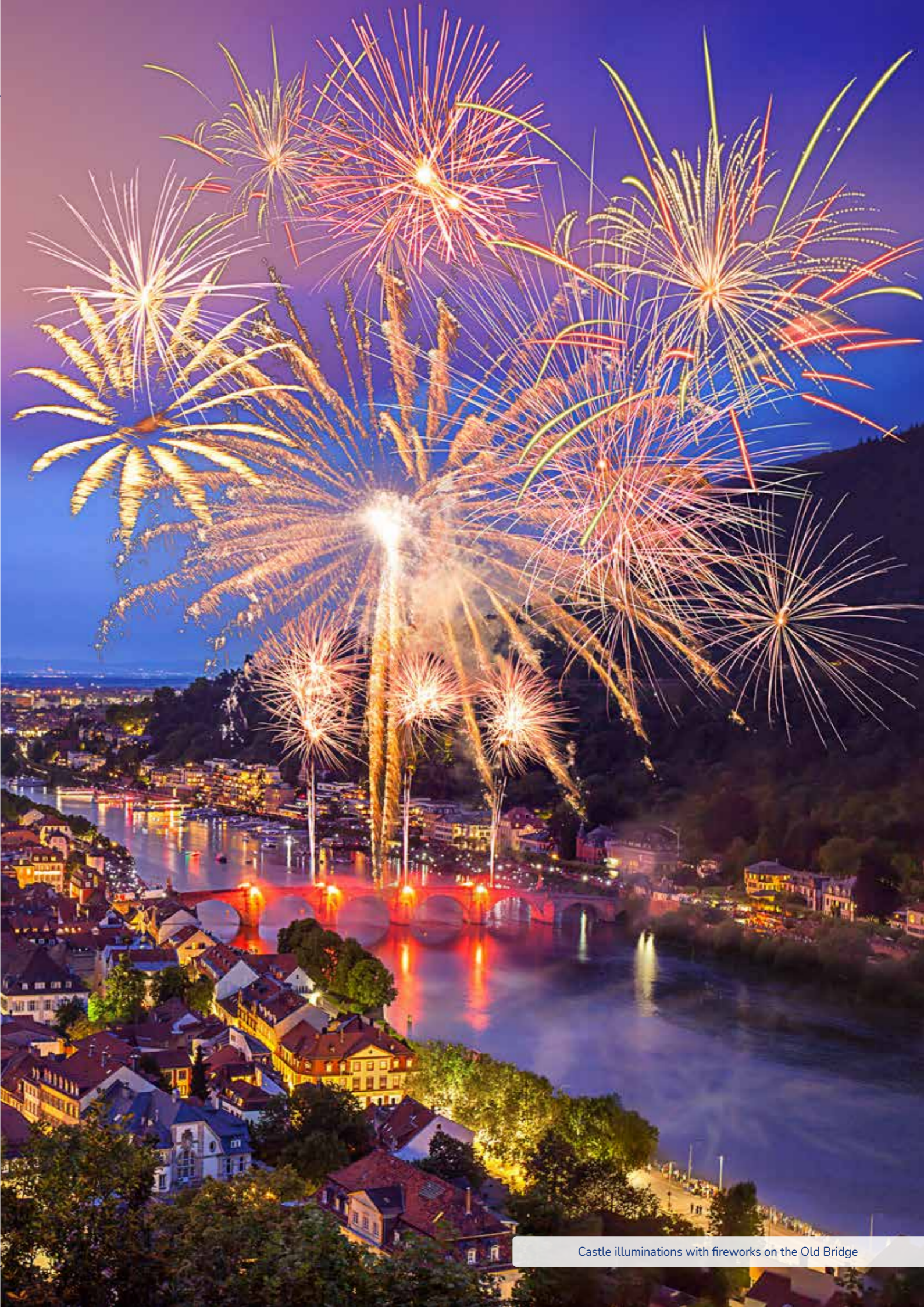
Castle illuminations with fireworks on the Old Bridge