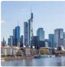
Frankfurt am Main