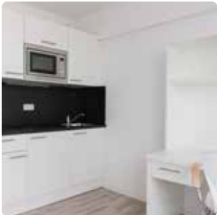
F+U Campus hall of residence, category E