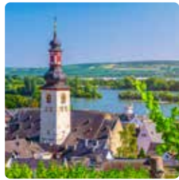
Rudesheim / Rhine

We will be happy to make you an offer for a transfer from the airport or train station to your accommodation. For single journeys see page 13.