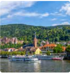
Boat tour on Neckar

****We will be happy to make you an individual offer. If your preferred activity is not included, just let us know.