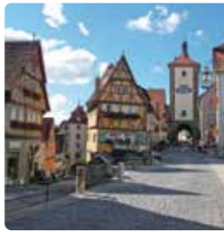
Rothenburg ob der Tauber