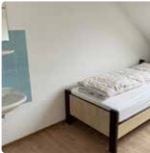
Concordia hall of residence, category A