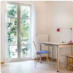
März hall of residence, category E