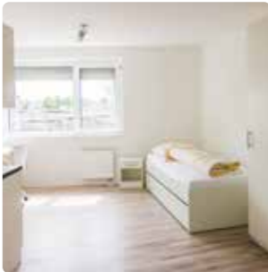
F+U Campus hall of residence, category E