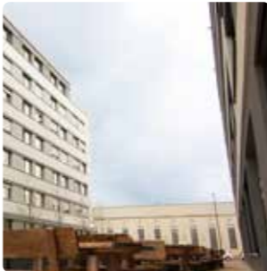
F+U Campus hall of residence, category E