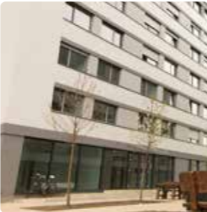
F+U Campus hall of residence, category E

Parking is possible in the unguarded parking spaces of the Concordia residence for €50 / week. There is a public paid car park in the school building (approx. €195 / month). Advance booking required.