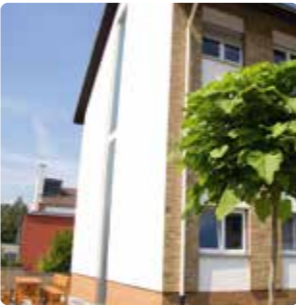
Concordia hall of residence, category A